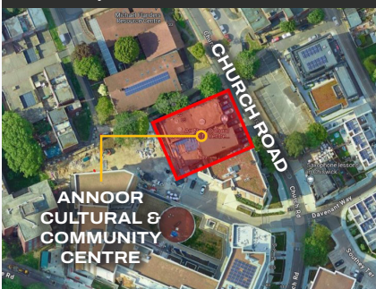
Site location plan

We are keen to hear your thoughts, ideas and suggestions to ensure that the very best scheme is brought forward. Join us at one of our upcoming events below.